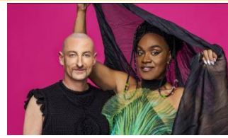
Australia Electric Fields - One Milkali (One Blood)